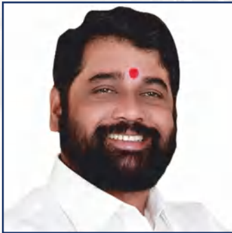
Hon. Shri. Eknath Shinde