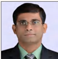
Hon. Shri. B. Venugopal Reddy, IAS

Minister of State, Higher & Technical Education, Government of Maharashtra