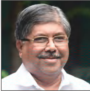
Hon. Shri. Chandrakant Patil

Minister, Higher & Technical Education, Government of Maharashtra