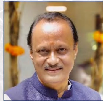
Hon. Shri. Ajit Pawar