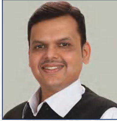
Hon. Shri. Devendra Fadnavis